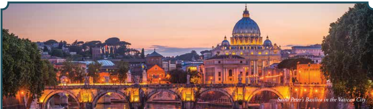
Saint Peter's Basilica in the Vatican City