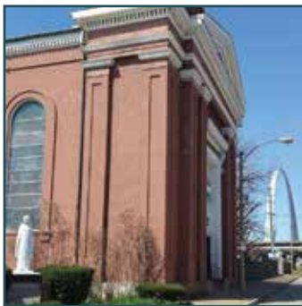
St. Mary of the Victories in St. Louis