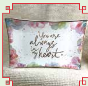
WHITE CERAMIC TRAY – $12.50 Says "You are always in my heart" with a watercolor flower petal design