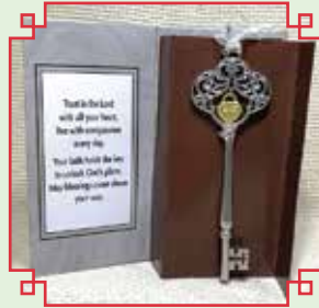
KEYS TO FAITH ORNAMENT – $7.25 1½" x 4½" silver-toned with tiny gold cross lock charm, comes in gift box with inspirational words