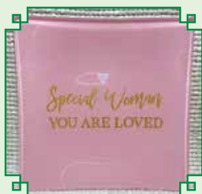
PINK CERAMIC TRAY – $11 Says "Special Woman You Are Loved" in gold with a tiny white heart