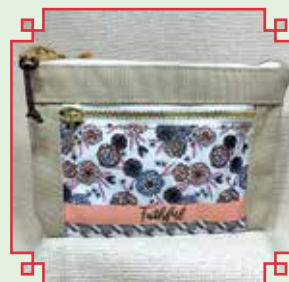
FAITHFUL POUCH – $13 5½" x 8" zippered canvas bag with front pocket, flower design and "Faithful"