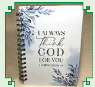
SPIRAL BOUND JOURNAL – $11 6" x 8", includes 100 lined sheets and hard-back cover with 1 Corinthians verse