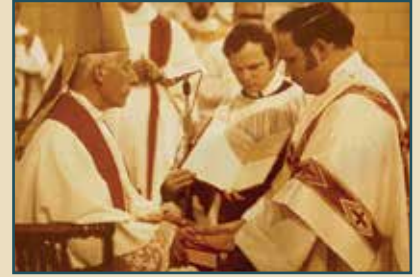
Ordination, June 21, 1973