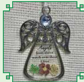
ANGELS FROM ABOVE ORNAMENT – $9 Silver-toned with pressed flowers, says "Angels from above watch over those I love"