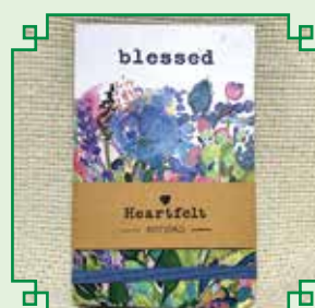
HEARTFELT NOTEPAD – $8.25 3" x 6", says "blessed" with a flower design and wraparound elastic band