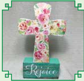
REJOICE CROSS – $10 7" standing wood cross with flower design mounted on teal box, says "Rejoice"

QUANTITIES ARE VERY LIMITED. Find more clearance items at www.SEELOS.org/gift-shop . Get them before they're gone!