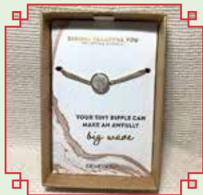
BRACELET – $13 Gold-toned with marbled-style disk, adjustable, "Strong Beautiful You - Your tiny ripple can make an awfully big wave"