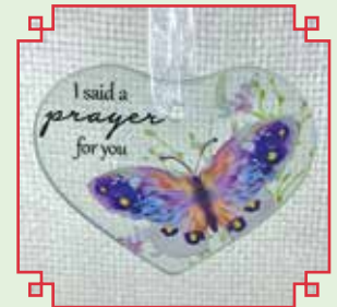
BUTTERFLY ORNAMENT – $9 2½" clear glass heart with butterfly design, says "I said a prayer for you"