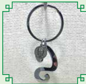
SEELOS INITIAL KEYCHAIN – $9 Silver-toned Seelos medal with choice of initial: B, D, F, G, H, L, M, N, P, R, S or W