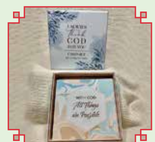
NOTECARD SET – $9 Blank, includes envelopes and 24 cards: "I Always Thank God for You" and "With God All Things are Possible"

To order, call (504) 525-2495 or visit www.SEELOS.org/gift-shop