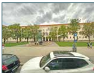
University of Munich

For Blessed Seelos, the missionary calling meant leaving a quaint and very Catholic home town for the much more austere Redemptorist houses in America, often without the basic conveniences known back home. We know, for example, that Blessed Seelos and St. John Neumann had to share the same room in the rectory of Pittsburgh. Only a curtain between the beds provided a bit of privacy for the two men.