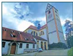
St Mang's Parish Church