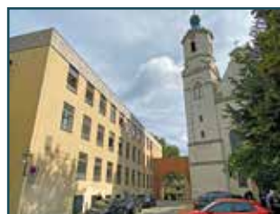
St. Stephan's High School