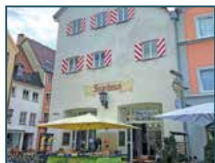
"The Kornhaus" Grade School

America had not yet had the leisure time needed for the greater refinement of being settled. So, for instance, while the missionaries, with their long habits, walked their missionary journeys they dirtied their hems on muddy roads and boardwalks. The cobble streets of their homelands were a thing of the past, as were so many other details taken for granted.