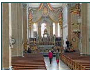
Inside St. Mang's Church

America had not yet had the leisure time needed for the greater refinement of being settled. So, for instance, while the missionaries, with their long habits, walked their missionary journeys they dirtied their hems on muddy roads and boardwalks. The cobble streets of their homelands were a thing of the past, as were so many other details taken for granted.