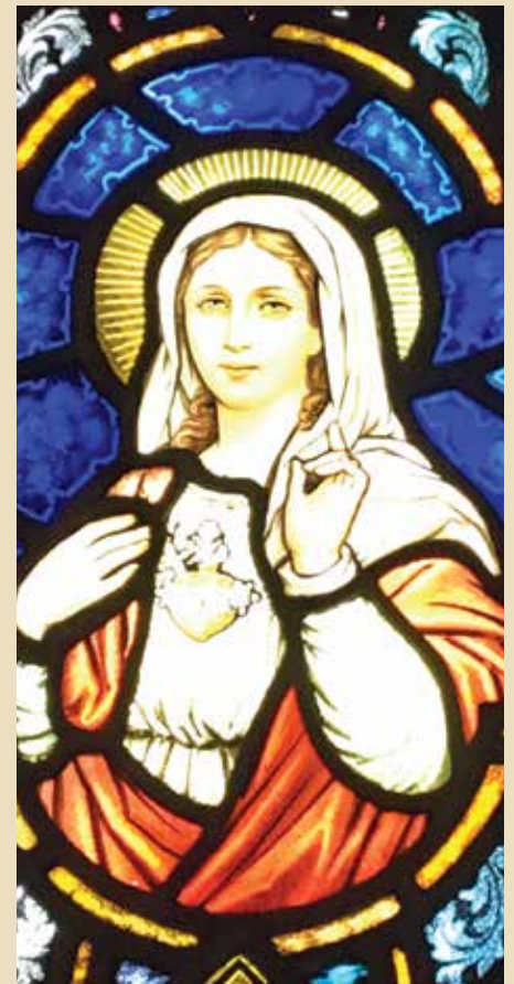
Stained glass window in St. Mary's Assumption Church, New Orleans