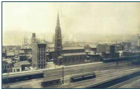
St. Philomena Church

with only a curtain separating our places of rest. I often heard him praying late into the night. He was wonderful to live with.