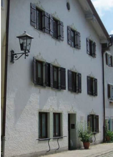
Visit Blessed Seelos' childhood home in Füssen, which still stands today.

The following itinerary is a sampling of what we might look forward to on this special trip: