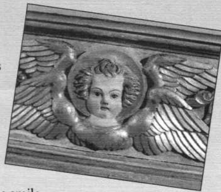
Detail, high altar, St. Mary's Assumption Church, New Orleans; mid-nineteenth-century bas- relief, wooden polychrome.

Gift-boxed sets of 20 "Cherub" cards and envelopes. Each card measures 5-1/2" x 4-1/4"; blank on inside; scripture verse on back reads: "From the angel's hand the smoke of the incense went up before God, and with it the prayers of God's people (Rev. 8:4)." Donation of $12 (plus $2 p/h) supports the Blessed Francis Seelos cause.